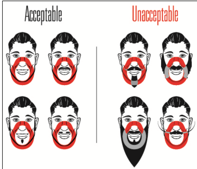
Figure 2: Facial Hair Standards