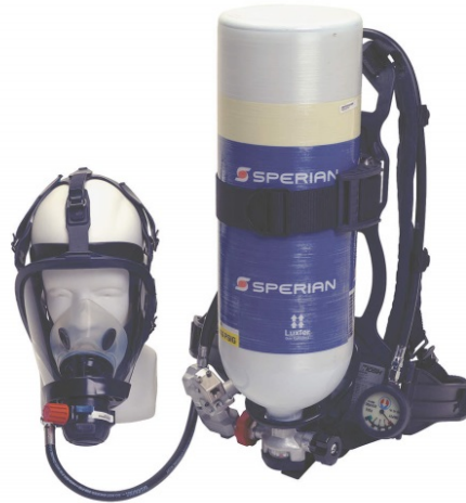
Figure 1: Self-Contained Breathing Apparatus