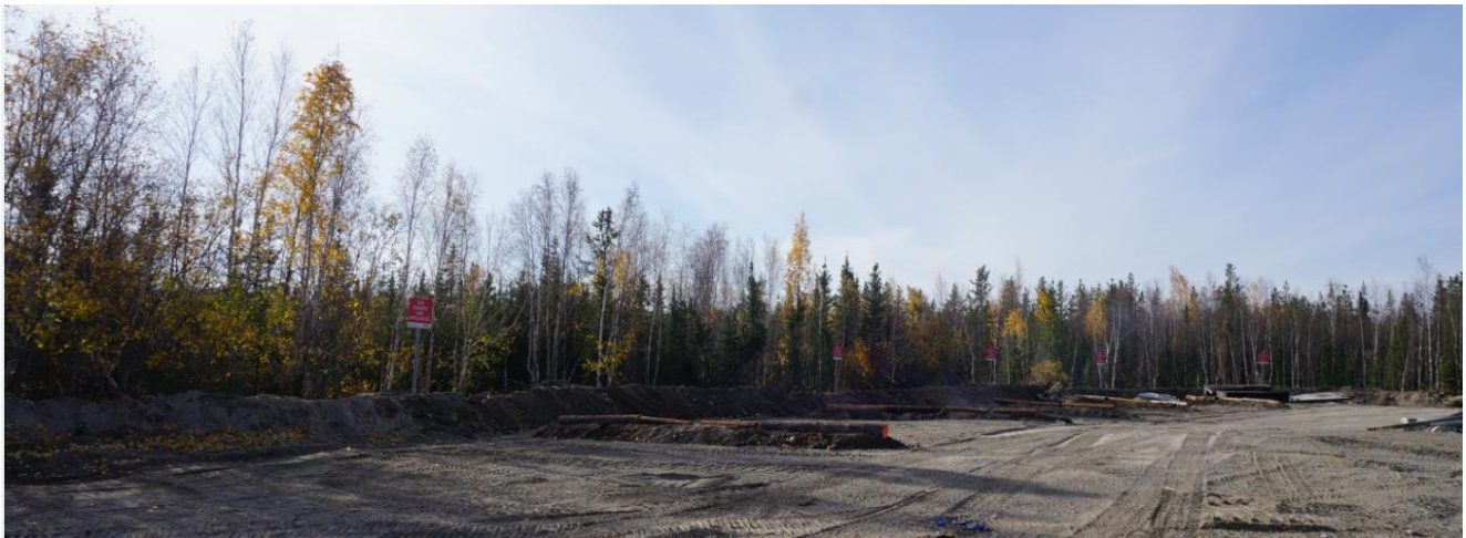
Figure 2- Photo of the Snare Disposal Site