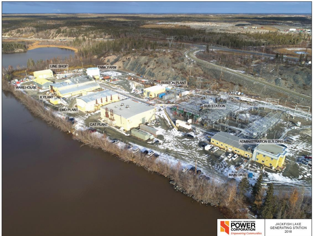
Figure 1-1: Jackfish Lake Generating Facility