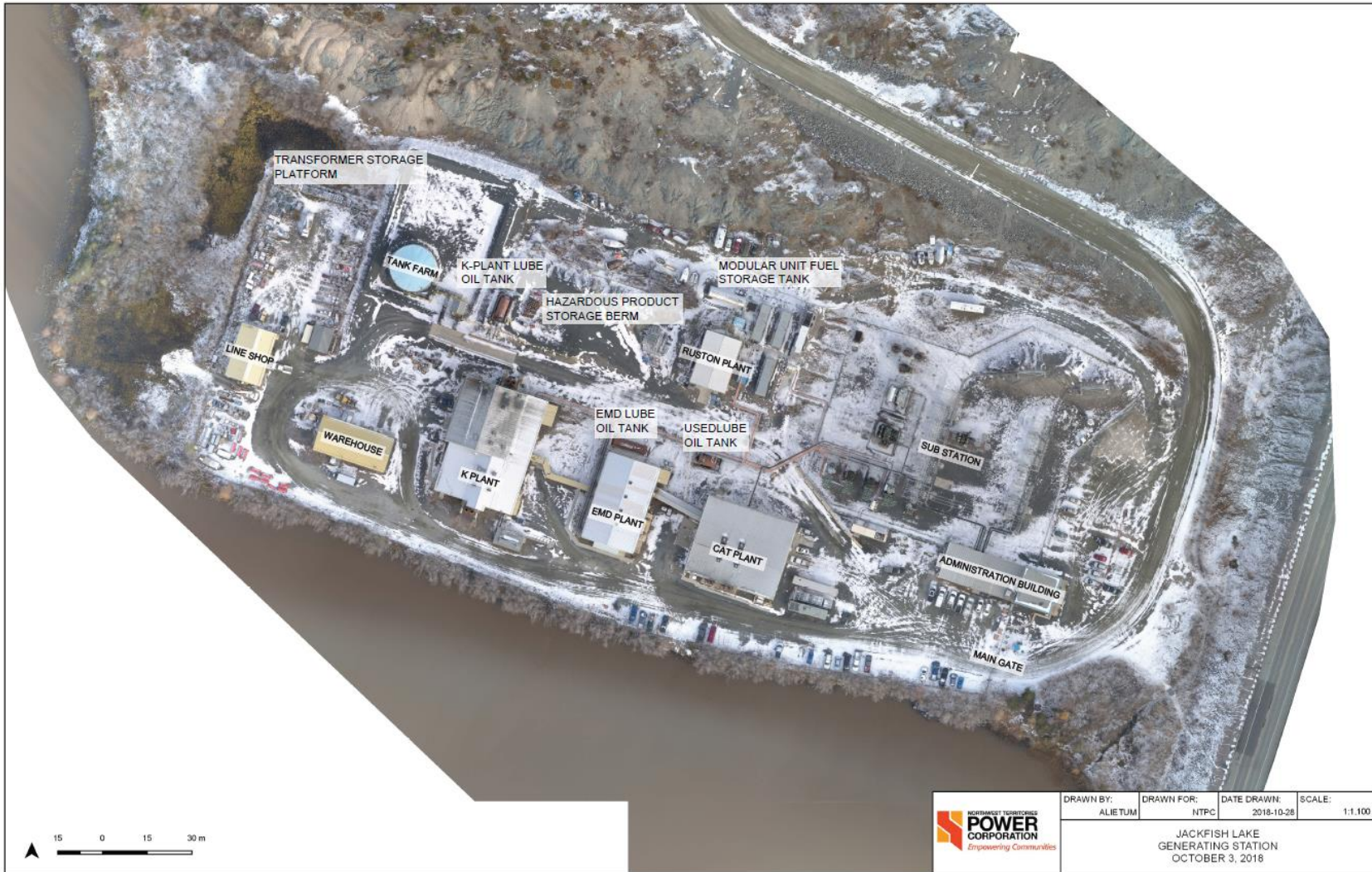
Figure 2-1: Location of Main Hazardous Waste Storage at the Jackfish Facility