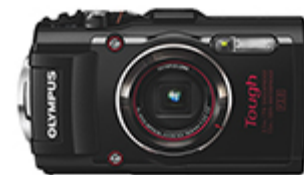
Olympus TG-4 Waterproof/Shockproof 16MP 4x Optical Zoom Digital Camera - Black or Red