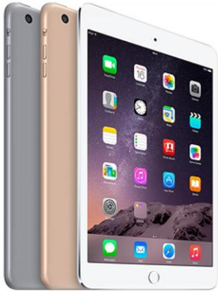
Apple iPad Air or iPad Mini 3 with retina display-16GB- in Space Grey and Silver (also Gold for iPad mini 3)

Level 4 Rewards are slightly different because of the amount. You can choose any of the gift cards in Table 1 on page 27 or choose from the various products below. (Depending on availability)