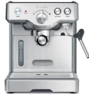
Breville 800ESXL Duo Temp Espresso Machine with accessories