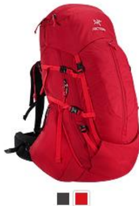
Five day plus, 62 litre volume trekking and backpacking pack constructed with the new C 2 Composite Construction suspension system.